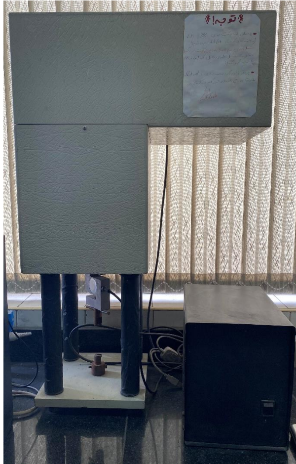
دستگاه تست خوردگی تنشی SSRT