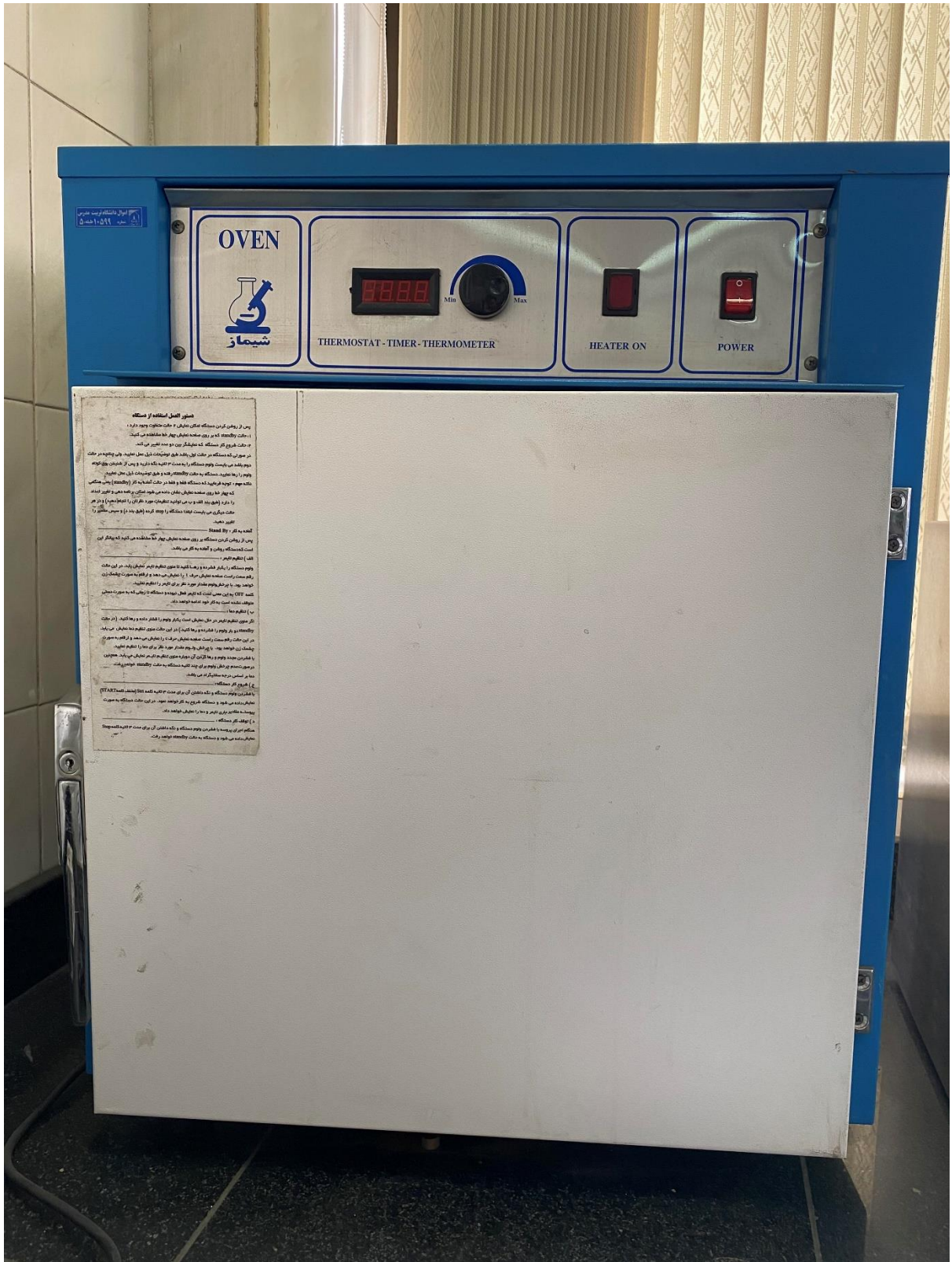
Oven (70 °C to 200 °C)