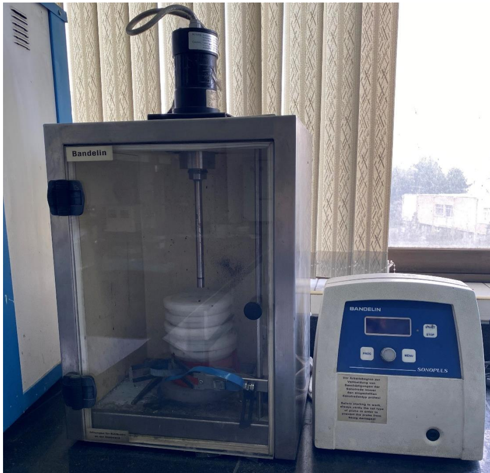
SONOPULS Ultrasonic Homogenizer