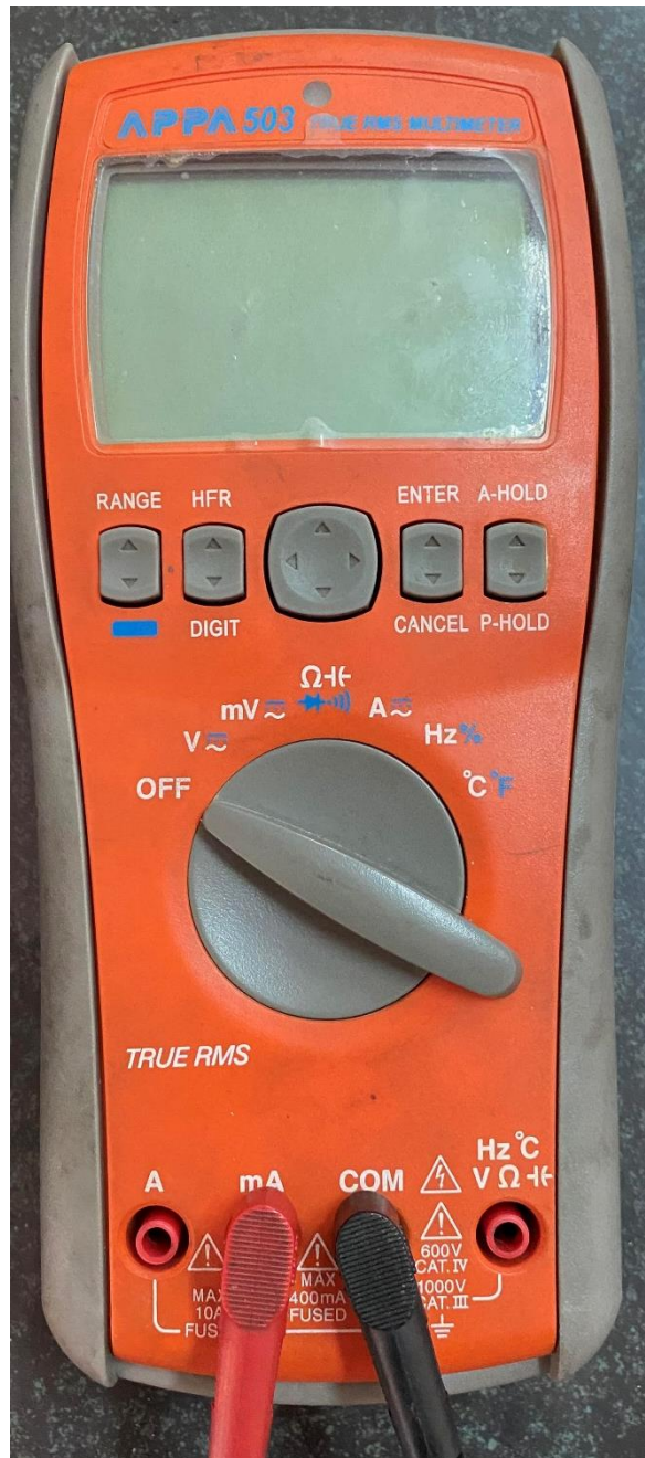
True RMS Multimeter